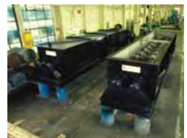
Pug Mill Mixers

Heyl & Patterson designs a versatile pug mill that continuously mixes all types of products, including dry, free-flowing powders, thin slurries and thick pastes. The compact design of this pug mill allows installation in low headroom areas. Mixing intensity, retention time and product appearance can be controlled simply by changing the agitator speed or paddle orientation.