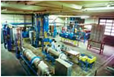
Pilot Plant Lab Facility