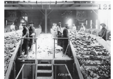
Vintage Photo From Our Archive

The MultiDisc® Thermal Processor is recommended for countless drying and cooling applications. Its innovative design reduces surface fouling, pluggage and power consumption, effectively reducing overall operational costs.