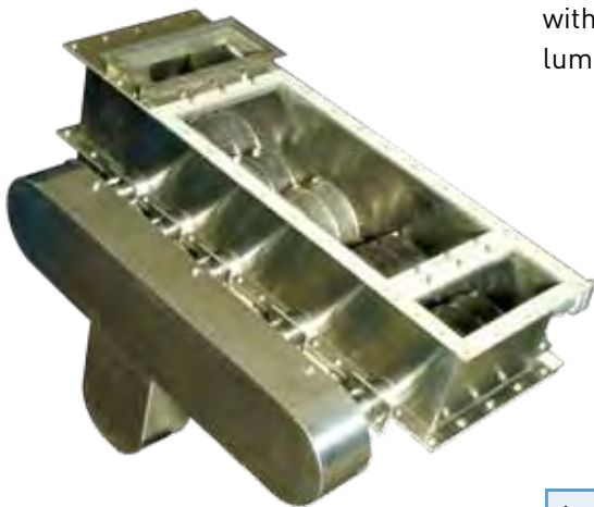
MultiDisc® Thermal Processor Production Model