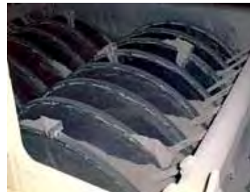
MultiDisc® Thermal Processor Used in the Chemical Industry

At Heyl & Patterson, we've been pioneering solutions for the chemical processing industry since 1887 – let our experience work for you. For further information, visit www.heylpatterson.com or call today.