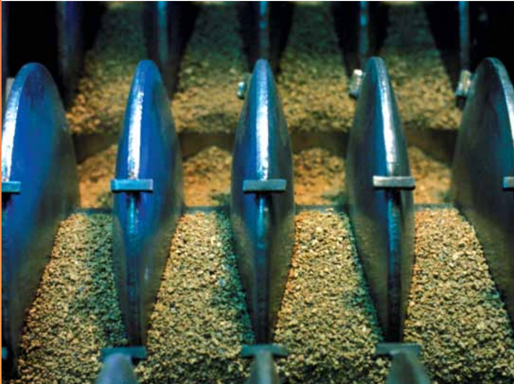
MultiDisc® Thermal Processor Used in the Mining & Minerals Industry

Heyl & Patterson's Renneburg Division provides custom-engineered processing solutions in a wide range of equipment. MultiDisc® Thermal Processors, Calciners, Agglomerator/Granulators, Screw Presses, Chain/Flail Mills and Pug Mill Mixers allow for delumping, dewatering, pressing, granulating refining and milling of bulk materials.