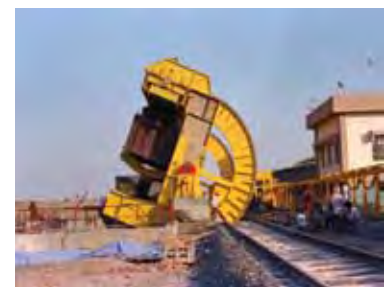
Wagon Tippler at 150-degree rotation

In an exclusive agreement with FLSmidth India, Heyl & Patterson designs Wagon Tippers and Side Arm Chargers, and is responsible for the performance of the design. Fabrication takes place in India, with shops that both Heyl & Patterson and FLSmidth have qualified and approved. Inspection during fabrication, as well as startup during erection, is jointly performed by Heyl & Patterson and FLSmidth as needed.