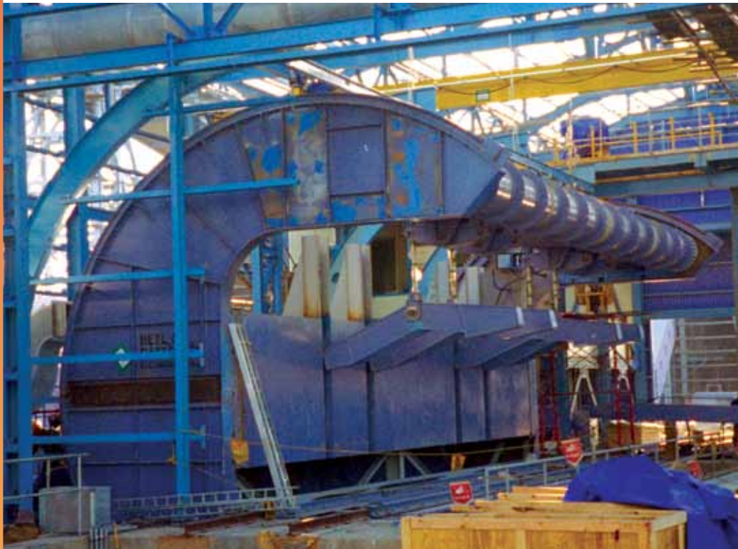
Wagon Tippler under construction

Heyl & Patterson Inc. – a history of trust and innovation.