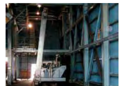
Side Arm Charger