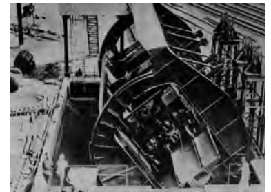
Vintage photo from our archive.

Heyl & Patterson becomes a real partner in your operations for the life of your equipment, with: