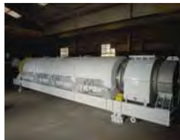
Renneburg Rotary Calciner

At Heyl & Patterson, we've been pioneering solutions for the chemical processing industry since 1887 – let our experience work for you. For further information, visit www.heylpatterson.com or call today.