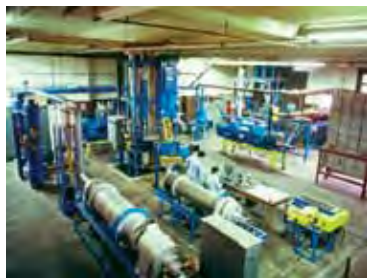
Pilot Plant Lab Facility