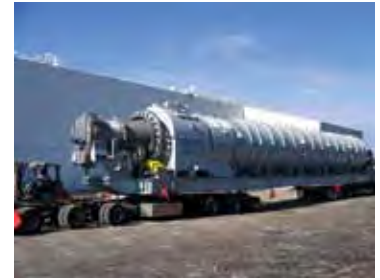
Shipment of Renneburg Rotary Calciner

Heyl & Patterson custom designs each Renneburg Calciner, incorporating the special requirements and features that are specific to each customer. Diameter, slope, rotational speed, capacity and volume are just a few of the complex variables that factor into the design of a calciner. Renneburg Calciners are designed for productivity, reliability and profitability.