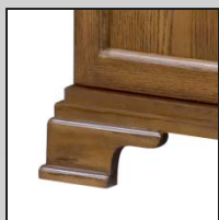
Raised base and leg detail

This transitional style media console features interchangeable door panels that allow a range of looks and function. Glass and wood inserts provide a choice of style while the fabric insert allows the option of hiding speakers inside the unit for a clean aesthetic. Finishing touches include the raised base and leg detail and cord management system.