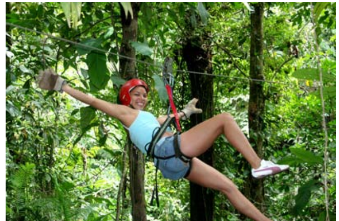
Adrenaline Rush in Costa Rica