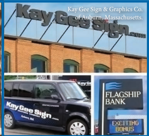
Kay Gee Sign & Graphics Co. of Auburn, Massachusetts.

operate them as separate realty entities. Our philosophy is to pay rent to ourselves and build equity. We lease the excess space to companies in related industries providing complimentary services, such as neon sign fabrication, rubber and polymer printing plate manufacturing and magnesium etching.