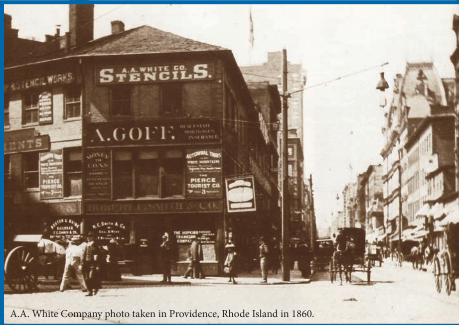
A.A. White Company photo taken in Providence, Rhode Island in 1860.