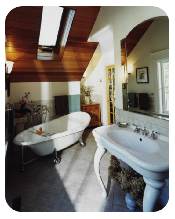
McClurg Remodeling & Construction Services www.McClurgTeam.com

If you're looking for some state of the art and futuristic features check out <u>HGTV</u>. Several of their designers visited a trade show and saw new products which include glass counter surfaces and panels, body drying units which save on use of towels, low flow toilets and even a space saving machine that washes, then dries up to nine pounds of laundry and is small enough to install in a bathroom.