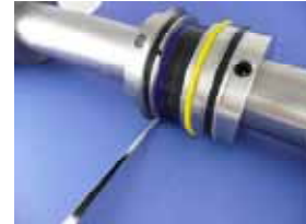
Crease & Cut