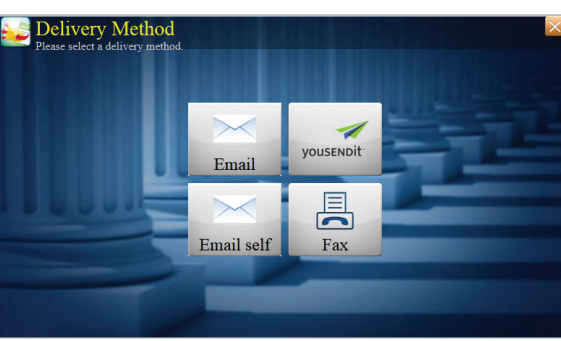
Multiple delivery option for users, based on preference