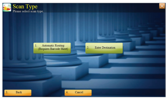
Users can choose between Barcode Sheets for automatic routing or simply enter the recipient's e-mail or fax destination