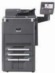
Shown with standard 270 sheet DSDP