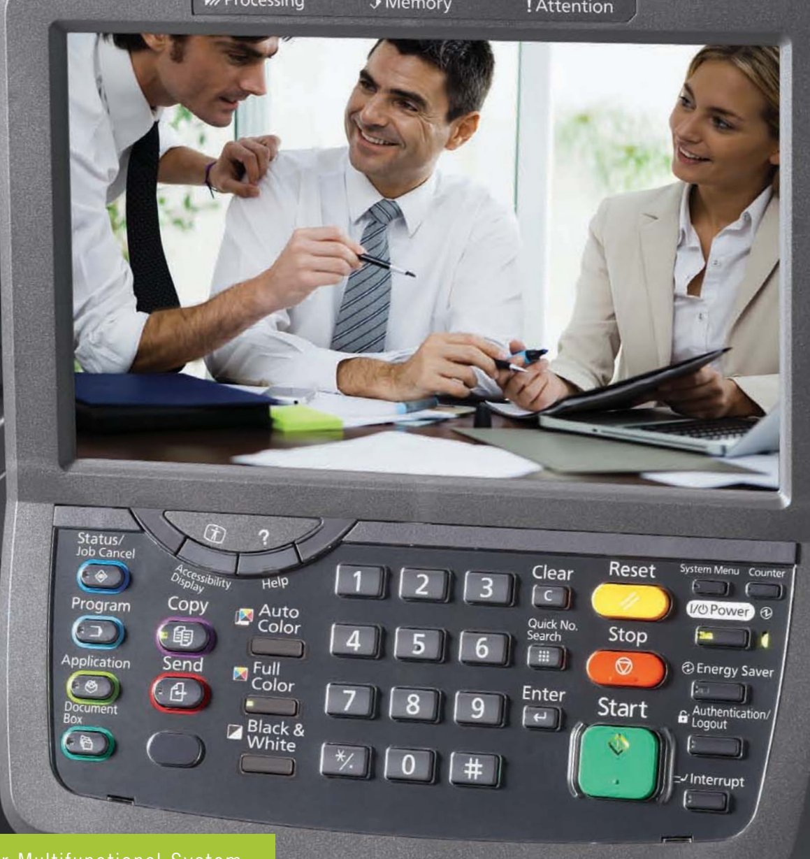
TASKalfa 6550ci | Color Multifunctional System

Powering Color Performance... Company-wide.