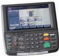
Newly designed, easy-to-use large color touch screen control panel