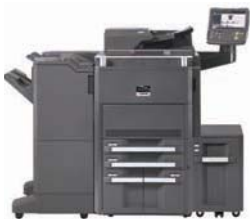
Shown with standard 270 sheet DSDP, optional 3,000 sheet side LCT and 4,000 sheet finisher