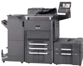
Shown with standard 270 sheet DSDP, optional 1,500 x 2 sheet trays, 500 sheet multi-purpose tray and 4,000 sheet finisher