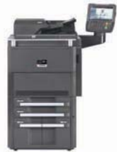
Shown with standard 270 sheet DSDP