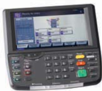
Newly designed, easy-to-use large color touch screen control panel