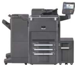
Shown with standard 270 sheet DSDP, optional 3,000 sheet side LCT and 4,000 sheet finisher