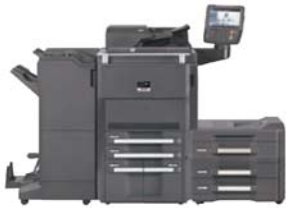
Shown with standard 270 sheet DSDP, optional 500 x 2 sheet paper trays, 500 sheet multi-purpose tray, and 4,000 sheet finisher