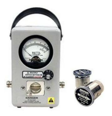
Bird Watt Meter and Element