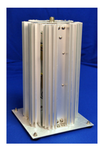
50 Ohm, 200W Test Load