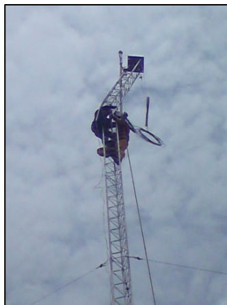
SAC Installation Site in Malaysia

Application: The Installation Kit is designed for use with RG25 Symmetrical "T" Support Towers and Mast Antennas.