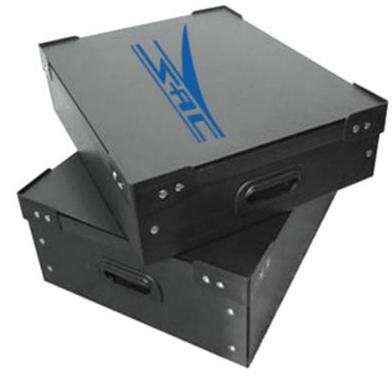
CURIGATED PLASTIC STRAGE CASE, WITH CUSTOM LASER CUT ANIT-STATIC FOAM HOUSING FOR EQUIPMENT

With test equipment essential troubleshooting and three critical system modules. the Field Repair Kit includes everything needed to make effective and efficient "in the field" repairs to a SAC NDB System. The antenna simulator and test load allow each section of the system to be isolated functionality, ensuring proper therefore isolating the issue. If a module needs to be replaced, simply exchange it for the new module in the Field Repair Kit, and send the failed module to SAC for repairs. Having the test equipment and modules on hand can greatly reduce system downtime, and even reduce the need for a service call. Save time, money and undue stress; own a Field Repair Kit.