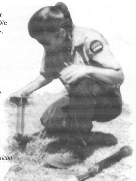
Environ Control technician installing Sentricon stations at a St. Louis Heights home.