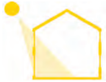
Passive Solar Gain