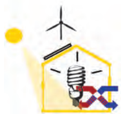
Cost Benefit Optimization

The Passive House Standard is the world's highest energy efficiency standard. It drastically reduces the energy load required to operate a building as much as 90 percent compared to existing buildings.