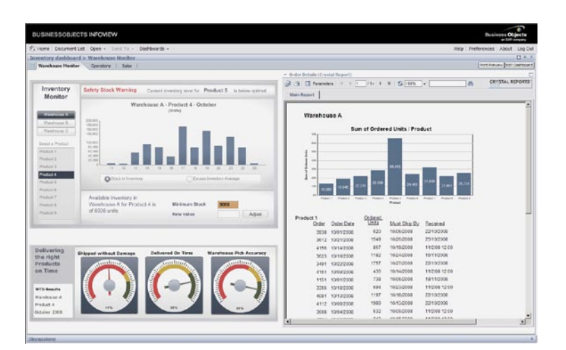
Figure 1: SAP<sup>®</sup> Crystal Dashboard Design Software Content Hosted on SAP Crystal Reports<sup>®</sup> Server

SAP Crystal Reports Server combines dashboards from SAP Crystal Dashboard Design software with reports designed with SAP Crystal Reports software to enable you to both view the summary information and understand the details behind it.