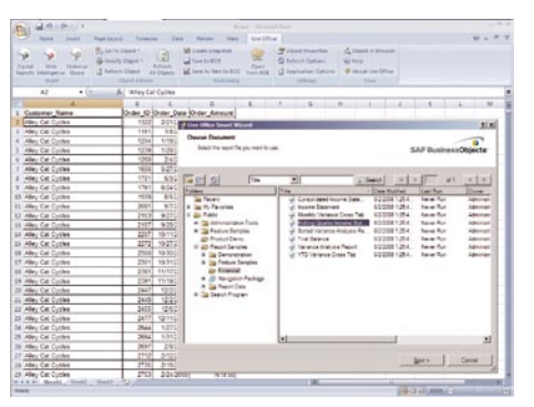
Figure 2: SAP<sup>∗</sup> BusinessObjects<sup>™</sup> Live Office: End-User Interface

SAP Crystal Reports Server includes SAP BusinessObjects<sup>™</sup> Live Office software that lets you expose SAP Crystal Reports documents and SAP