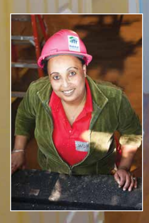
More than 1,000 families have purchased Twin Cities Habitat homes since 1986. 84% still live in their Habitat home.