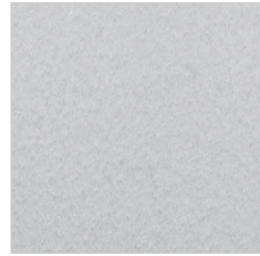
NATURAL GREY METALLIC