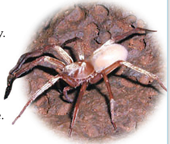
The cave wolf spider lives in caves in Hawaii.