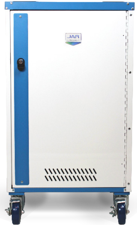
Back three-shelf view