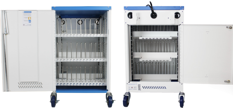
Front three-shelf view

The Ultra-Light Tablet Cart charges and transports up to 30 tablet devices. The cart features adjustable shelves and dividers as well as a charging cable management system. It fits most tablet cases up to 1.5" in width. The service door in the back allows for easy access during setup. The cart ships assembled and ready to go right out of the box. See the 2-shelf MD-3060 model for cases up to 11.5"H or the MD-3065-SYNC for sync and charge capabilities.