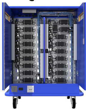
Efficient Cable Management