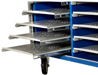
20 Convenient Pull-Out Trays