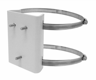
PA101 POLE ADAPTER