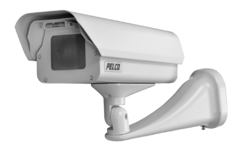
EH3512 ENCLOSURE WITH SUN SHROUD AND EM3512 MOUNT

The EH3512/EH3515 Series are indoor/outdoor, low cost camera enclosures constructed from die cast and extruded aluminum. The EH3512 has a lower body length of 12.75 inches (32.38 cm) and the EH3515 has a lower body length of 15.75 inches (40.00 cm).