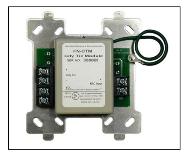
Rear view of FN-CTM City Tie Module

The contractor shall furnish and install where indicated on the plans, the Hochiki America FN-CTM City Tie Module. The module terminal blocks shall be capable of accepting up to 14 AWG wire. The FN-CTM shall be configured such that the Fire Alarm Control Panel's EOL (end of line) device connects directly with the FN-CTM to ensure supervision of the interface wiring. The module shall fit into a standard 4" electrical back box. The FN-CTM shall be Underwriter's Laboratories Listed for the intended purpose.