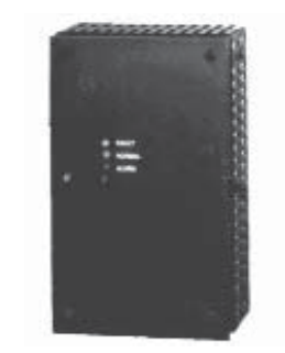
24-060 Voice Evacuation Module