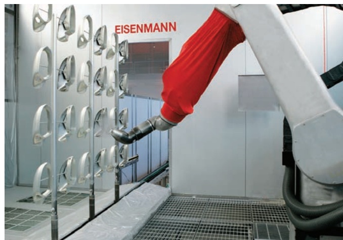
VarioBell v.2 – slim and speedy.