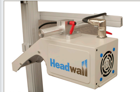
elliptical light source