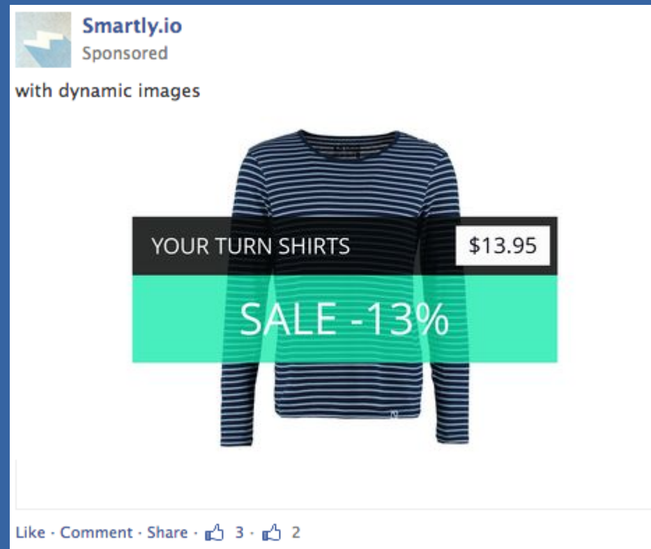
DPA with Dynamic Image Templates