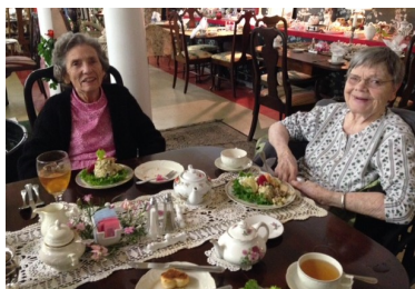
Serendipity Tea Room!