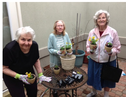
Plant a Flower Day!