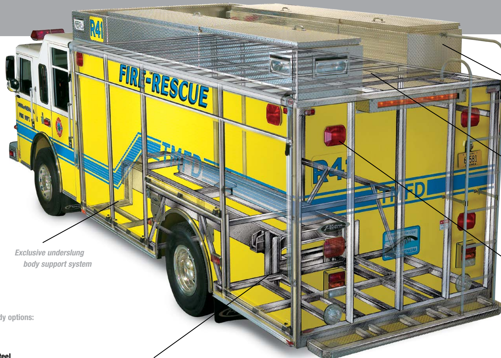
Exclusive underslung body support system

The Pierce® exclusive, underslung body support system is mounted to the chassis frame rails, supporting all exterior compartments and evenly distributing weight to the frame. An available drop-pinched frame accommodates 40.5" deep compartments ahead of the rear wheels. This modification increases original factory frame strength four times.