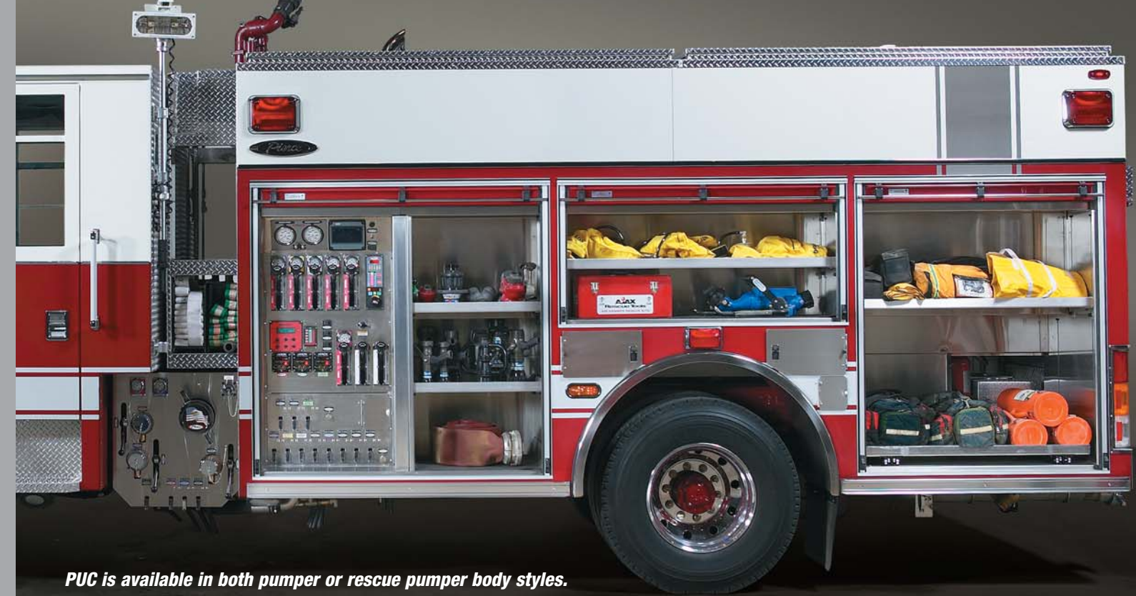
PUC is available in both pumper or rescue pumper body styles.