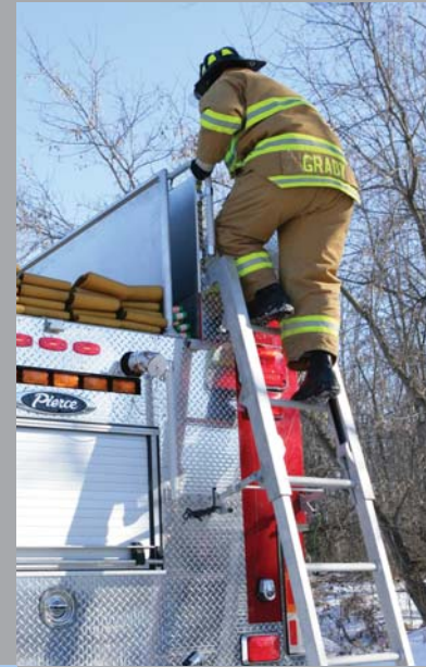
The folding ladder is angled for a safer climb

Safety is built into every product we make. But we've raised the bar with the PUC which boasts an impressive list of features – like positioning the pump operator next to hose connections instead of over them. And incorporating chest height crosslays, chest height ladder storage, ladder access to hosebed, 8"-12" lower hosebeds, and stokes/backboard storage that you can reach from the ground – where you belong.