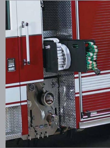
Chest height crosslays