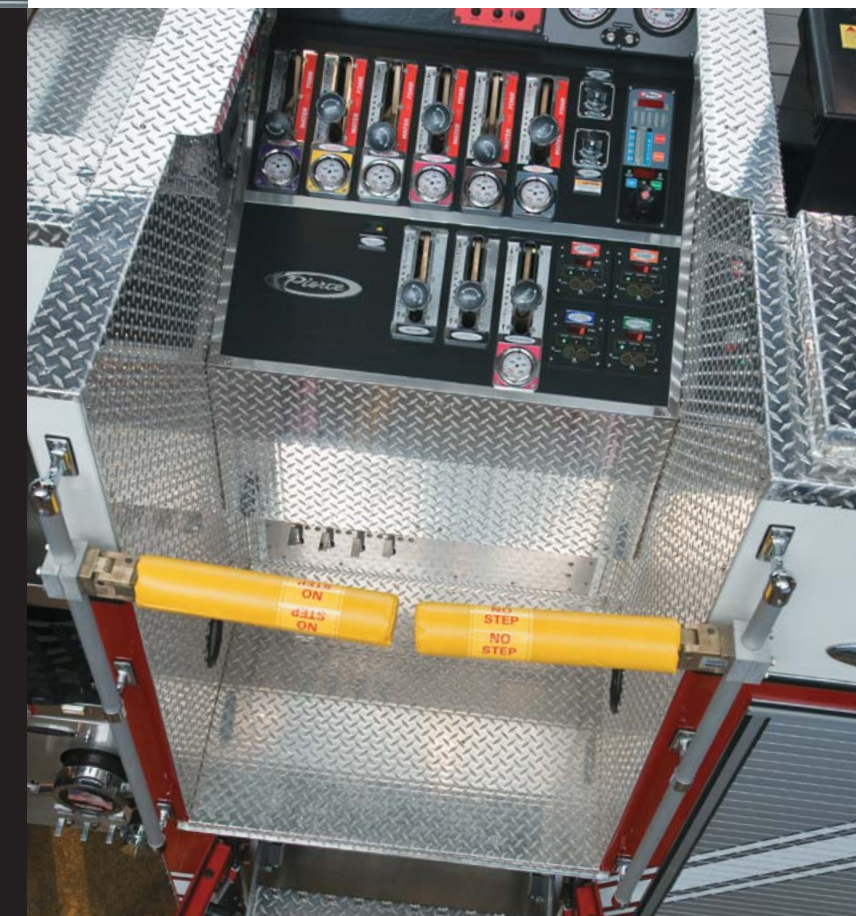
PUC top mount pump panel

PUC is available as a side mount, top mount or 75' aluminum aerial ladder.