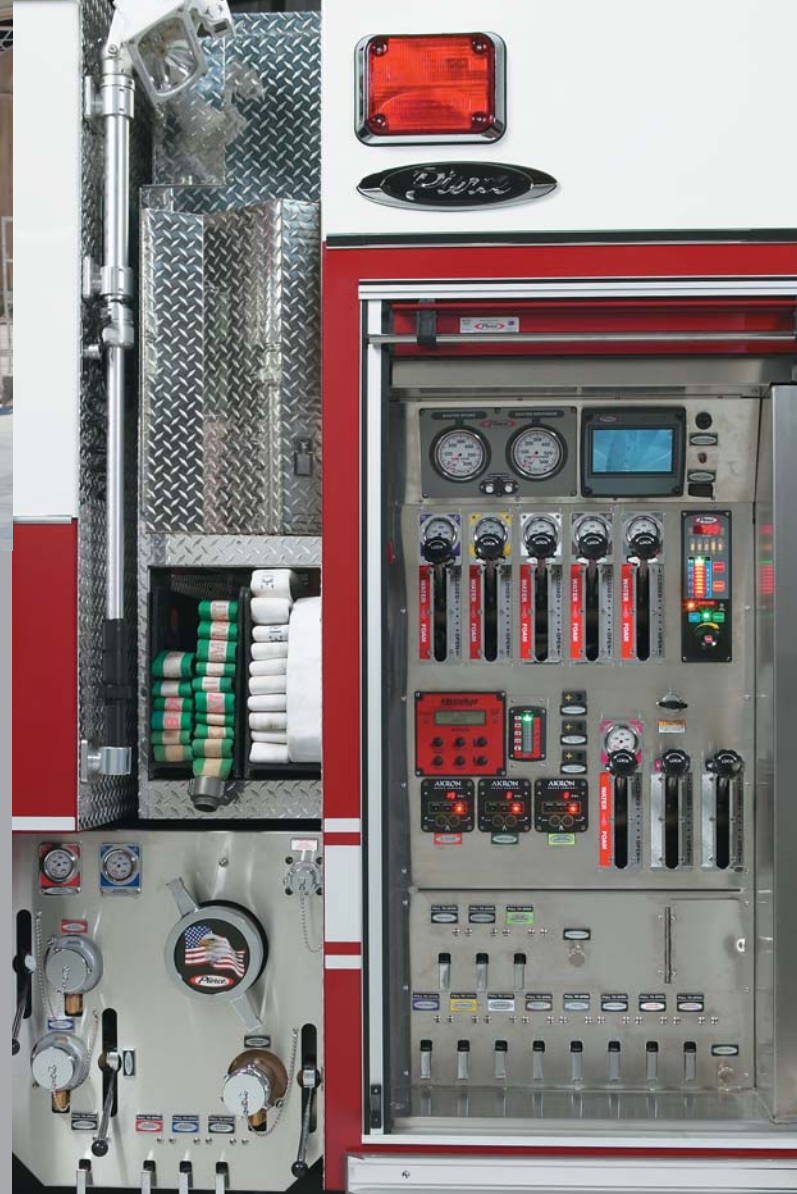
PUC side mount pump panel