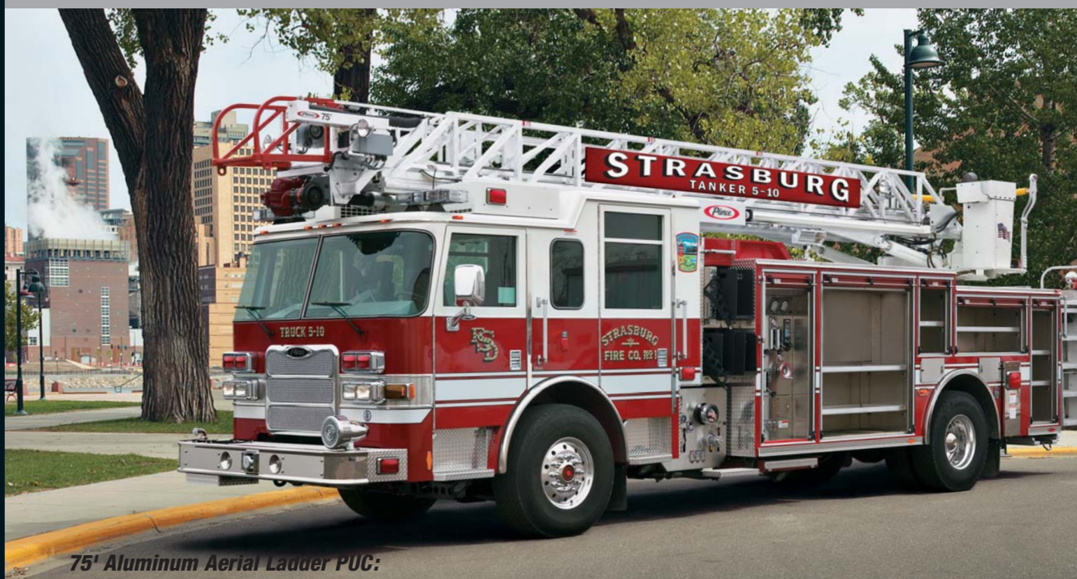
75’ Aluminum Aerial Ladder PUC: Additional 27 cubic feet of storage space Up to 5” shorter wheelbase than standard aluminum aerial Lower crosslays True pump and roll