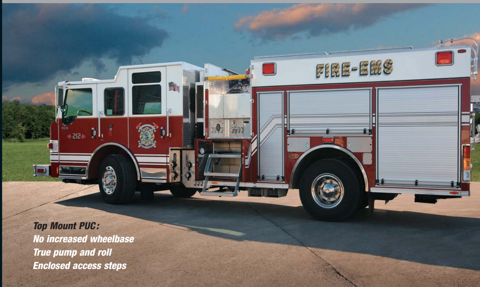
Top Mount PUC: No increased wheelbase True pump and roll Enclosed access steps