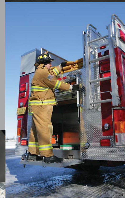
Space-saving rear folding work platform allows for easier access to the hosebed.