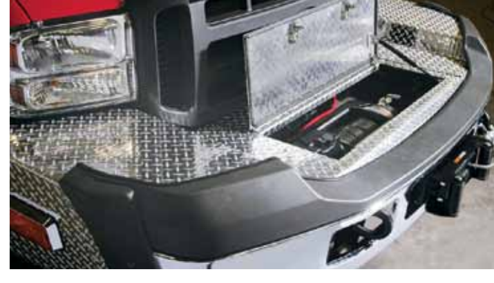
Extended front bumper fitted with optional winch.