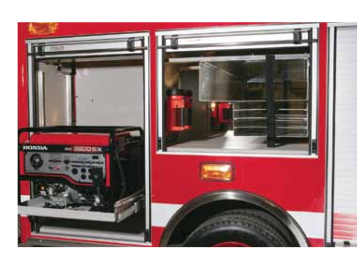
Easy storage and access for large items like generators and rescue tools.

Choose from a wide range of rescues in body lengths from 10 to 18 feet.