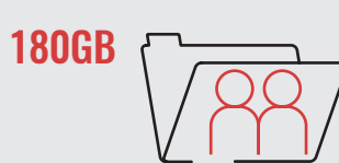
PUBLIC FOLDER INFORMATION