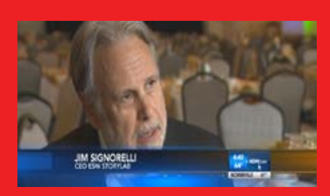
JIM MAKES THE NEWS http://youtu.be/Pe8h1PzAPAk