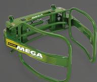
MEGA SOFTHANDS CONTRACTOR