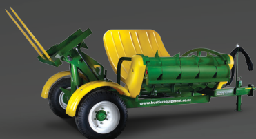
CHAINLESS 4000 TRAILED 2-BALE FEEDER