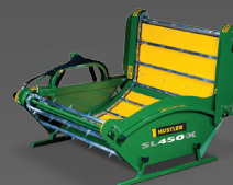
SL450X LINKAGE TROUGH FEEDER