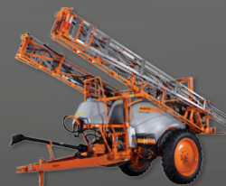
ADVANCE TRAILED 3000