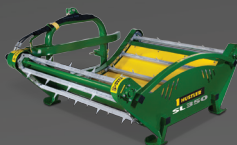
SL350 LINKAGE FEEDER