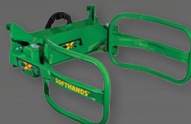
CXR SOFTHANDS FARMER