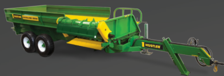
CHAINLESS 8000 TRAILED 4-BALE FEEDER

Our dealer network guarantees technical backup and quick replacement of parts.