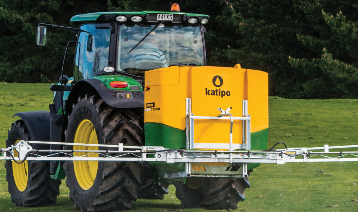
Katipo 1150 with 10 metre hydraulic Sonicboom.

Once bitten you'll be smitten! With farming at our core, and a love for machines our passion - the rethinking of our already successful sprayer range was pure instinct. The revolutionary Katipo for farmers and contractors embodies a raft of new features never seen in agricultural sprayers before - all designed to make your life easier.