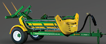
SL700X TRAILED 2-BALE FEEDER