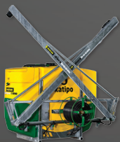
KATIPO LINKAGE 680-1150