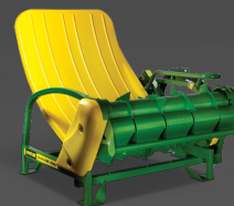
CHAINLESS 2000 LINKAGE FEEDER