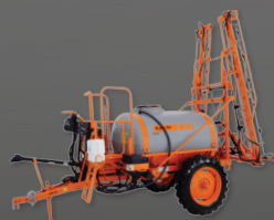
COLUMBIA TRAILED 2000