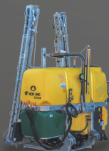
FOX LINKAGE 1200-2000