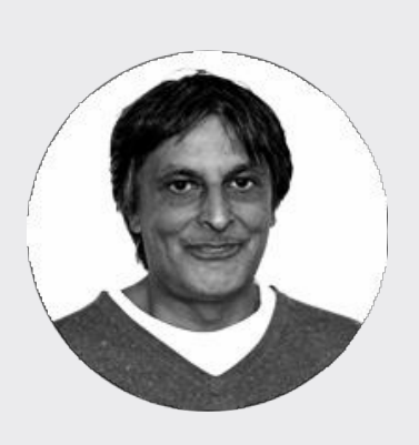
Online Systems Lead