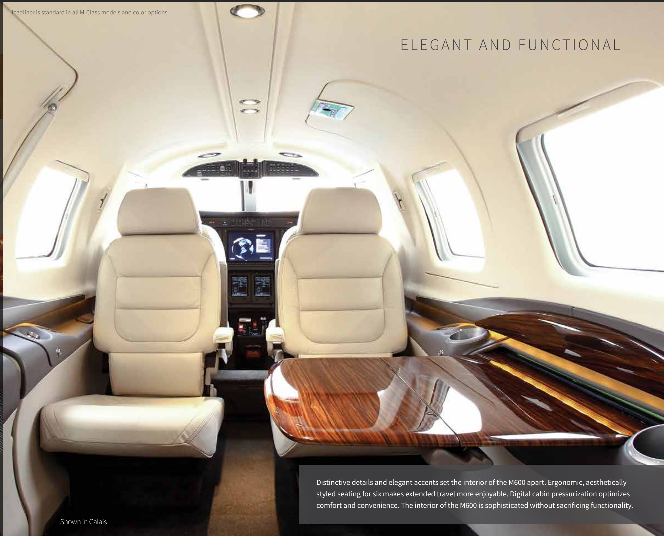
Shown in Calais

Distinctive details and elegant accents set the interior of the M600 apart. Ergonomic, aesthetically styled seating for six makes extended travel more enjoyable. Digital cabin pressurization optimizes comfort and convenience. The interior of the M600 is sophisticated without sacrificing functionality.