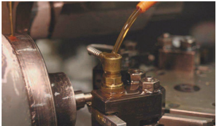
IMI 607A61 Swiveler® and armor jacketed cable immersed in cutting oil

IMI’s industrial accelerometers are constructed with stainless steel bodies to be corrosion and chemical resistant. If your application is located in an environment with harmful chemicals, consider using PTFE cable with corrosion resistant boot connectors. It is strongly recommended to check a chemical compatibility chart for any suspect chemicals. For cables that may come into contact with debris such as cutting chips or workers’ tools, integral armor jacketed cables offer excellent protection.