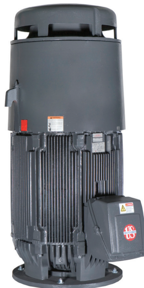
Vertical Solid Shaft High Thrust Motor