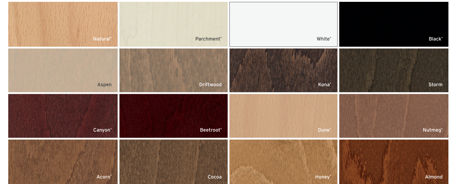
*Standard wood finishes available for the Bentwood, Lena, and Merano collections.