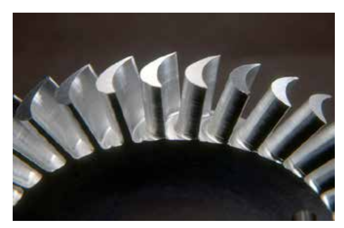
Axial blade row designed with AXIAL.

AXIAL utilizes integrated performance map plotting. Users can view blade angles and velocity triangles at the rotor inlet and exit, as well as view results in a flexible spreadsheet-like table view. Tables are customizable through separate filters, with the user able to create any number of filters, select what to display, and customize the labels as well.