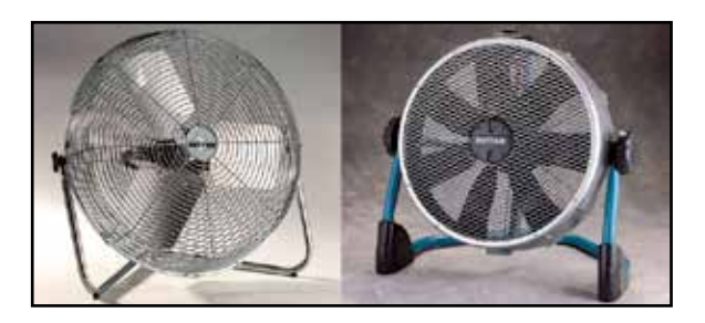
Previous generation Holmes High-Velocity Floor Fan (left) compared to quieter and more efficient new design (right).