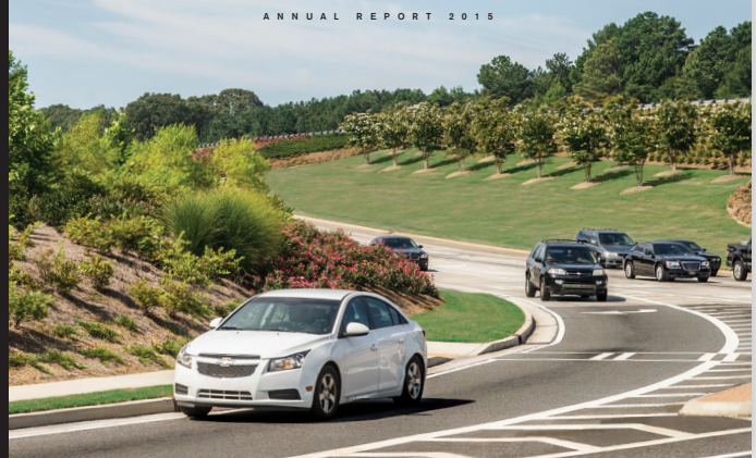
Annual Report Cover