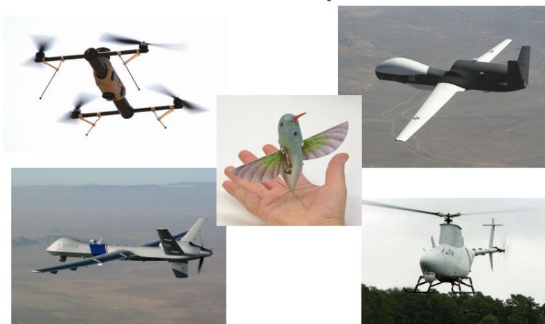
Figure 1: Various Configurations for Unmanned Aerial Vehicles [2]

The UAV/UAS has become a staple of the mission options available to the Department of Defense, with its roles and capabilities increasing along with utilization. However, this increase in utilization has been accompanied by significantly higher failure rates when compared to conventional airframes. The general aviation mishap rate is about 1 per 100,000 flight hours, while military UAV systems have experienced failure rates 2 orders of magnitude higher, nearly 1 per 1000 flight hours [1]. By another metric, some UAV systems have a failure rate of 25% [7]