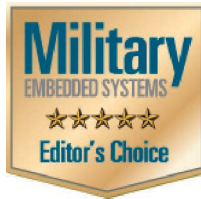
Military Embedded Systems Editor's Choice Award