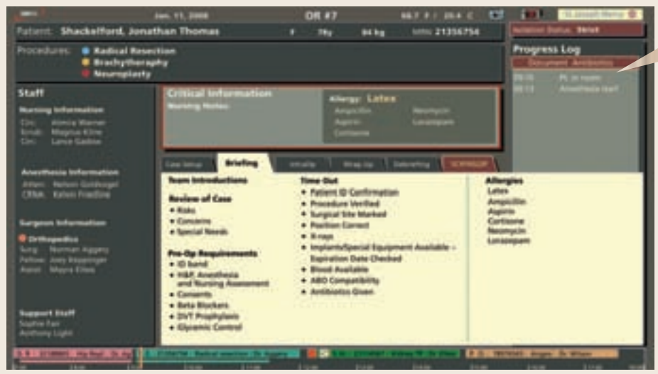
Fig.1: The OR-Dashboard display, as it appears during the "Briefing" phase prior to surgery