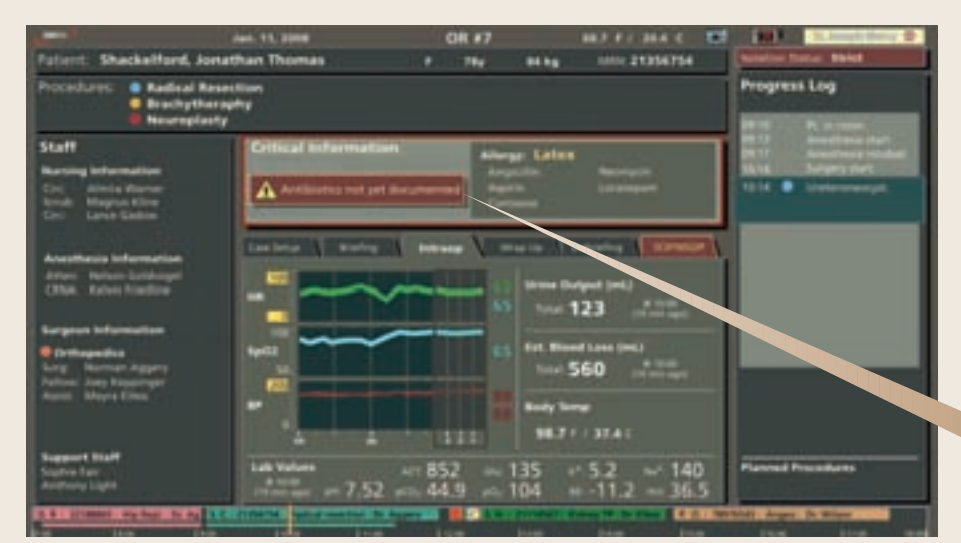
Fig. 4: The OR-Dashboard display, as it appears during the "intraop" phase when antibiotic administration was not documented

Features for assisting the OR team in carrying out SCIP guidelines are included in LiveData OR-Dashboard. Its real-time data functionality allows instantaneous display of information from medical devices and systems, including the nursing record. Thus, everyone in the OR can clearly see the status of antibiotic administration, as well as related prompts and reminders, at a glance.