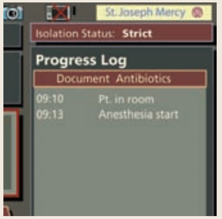
Fig.2: Reminder to document antibiotic administration