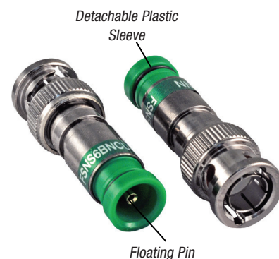
Detachable Plastic Sleeve