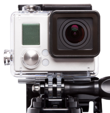
GoPro HERO3: White Edition Camera