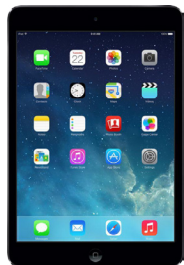
Apple iPad Mini 2