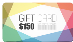
$150 American Express Gift Card