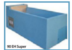
90 EH Super