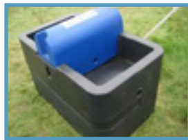
Black color attracts heat