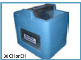
30 CH or EH