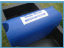
2 separate sections