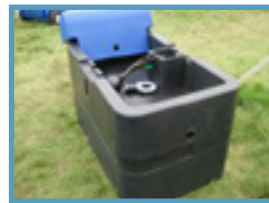
20 gallon tank